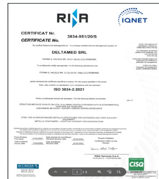
ISO 3834-2 Welding