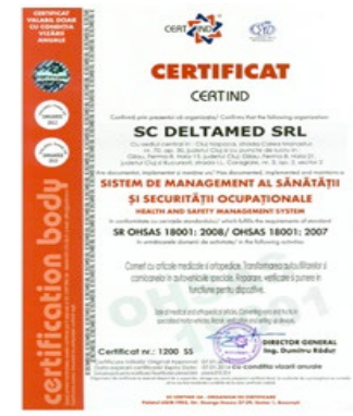
OHSAS 18001 Health and work safety