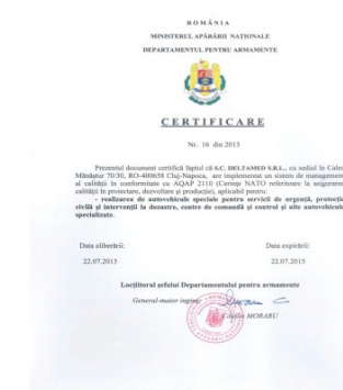
AQAP 2110 NATO quality