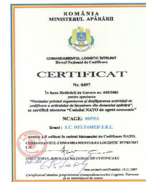
NCAGE NATO no.