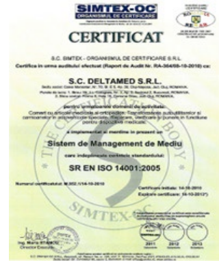
ISO 14001 Environment