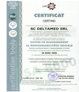
SA 8000 Social responsibility