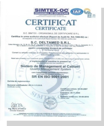
ISO 9001 Quality

Registered as a body builder at Romanian Auto Register Ambulances certified by notified bodies according EN1789:2020 + A1:2024