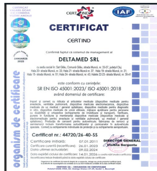
ISO 45001 Quality management